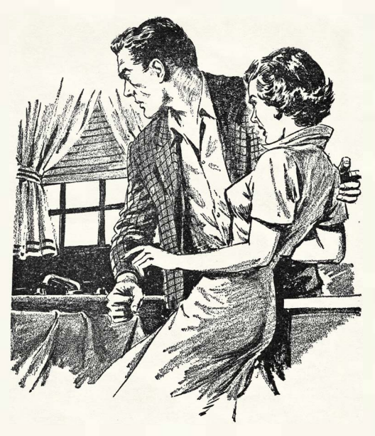
"A short life and a gay one" was luscious Nancy's motto. And in no time at all she'd left her husband . . .